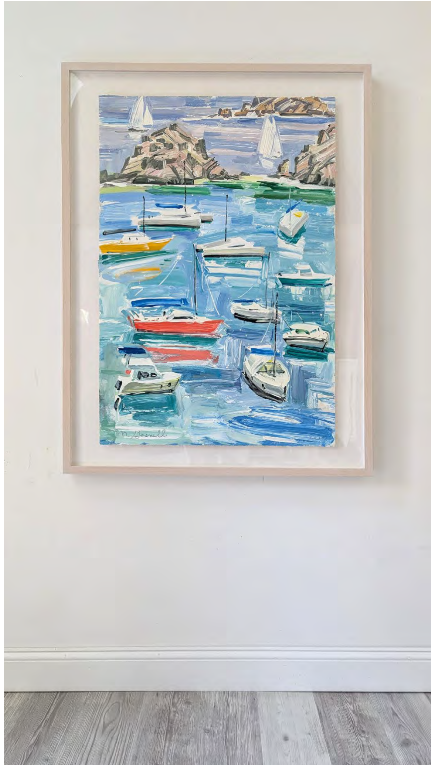
6. Gustavia Harbor , oil on paper, 41 x 30 in., 2024 installation view