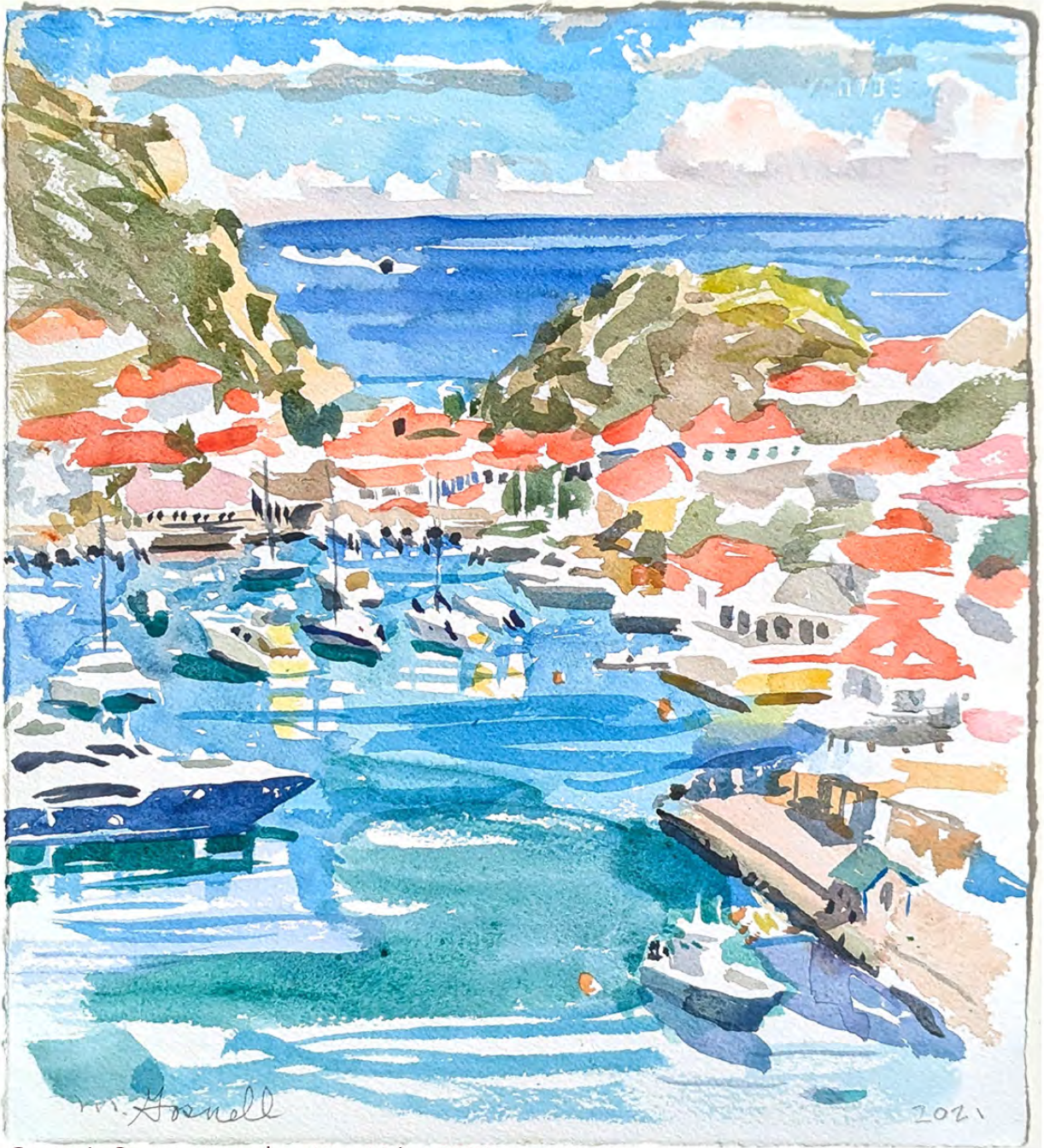
Gustavia Port , watercolor, 11 x 10 in., 2021

"Each series begins with color studies in which I records shapes and colored light. Later, I develop compositions inspired by my studies into large-scale oils. My studies contain my sensory memory. They are springboards to my full bodied first encounter. In 2021, I visited a friend's home in Lorient. Profoundly effected by the magical atmosphere of Saint Barth, I created my Saint Barth Series ."