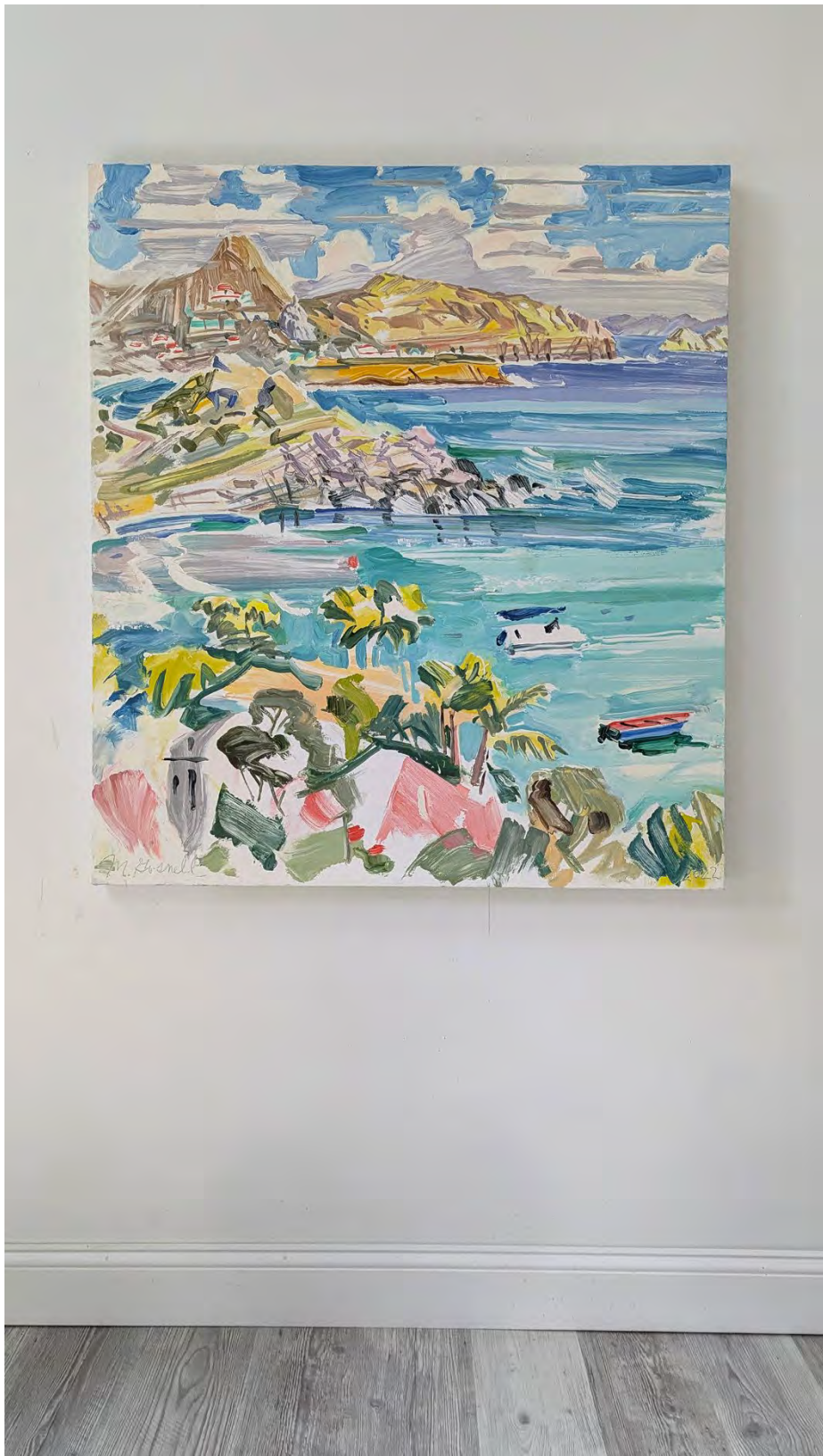
3. Lorient 1 , 48 x 42 in., oil on canvas, 2022 installation view