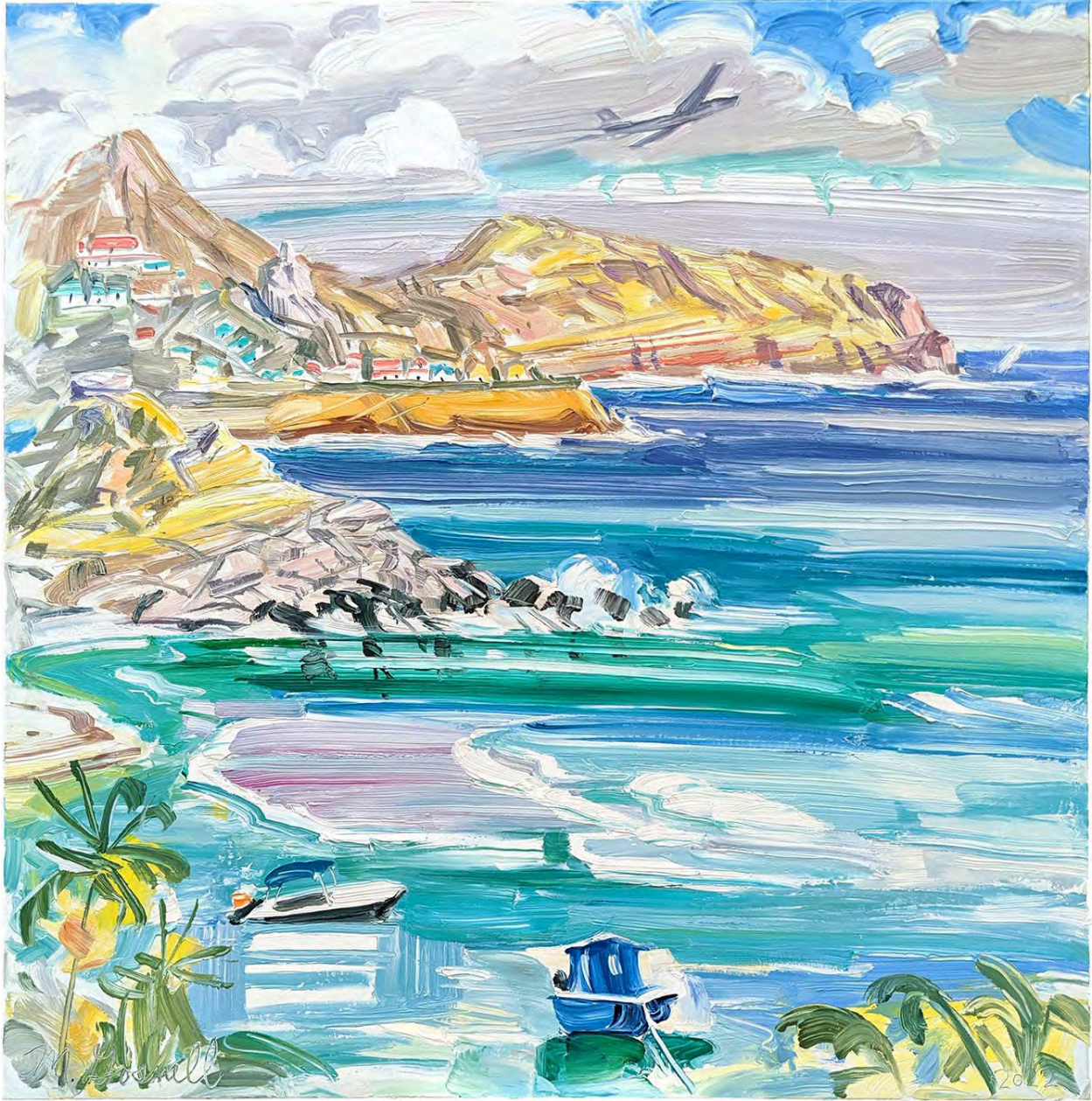
Lorient 2, 60 x 60 in., oil on canvas, 2022