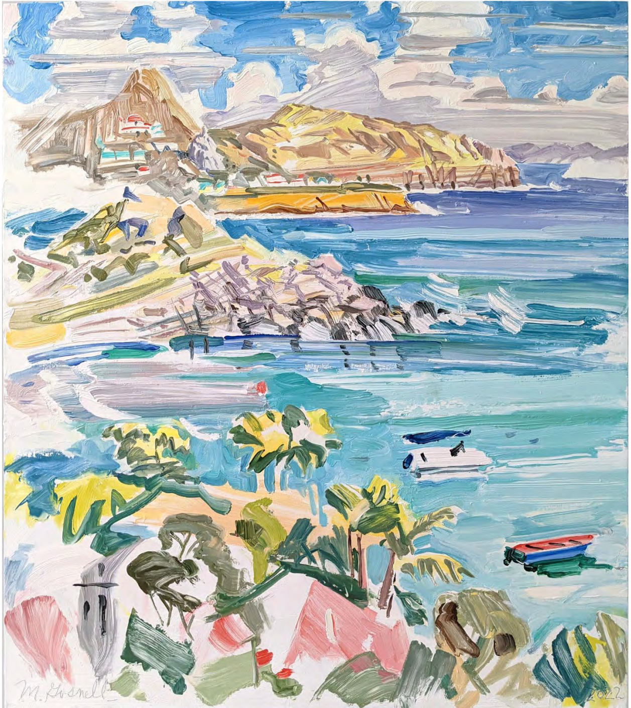
Lorient 1 , 48 x 42 in., oil on canvas, 2022