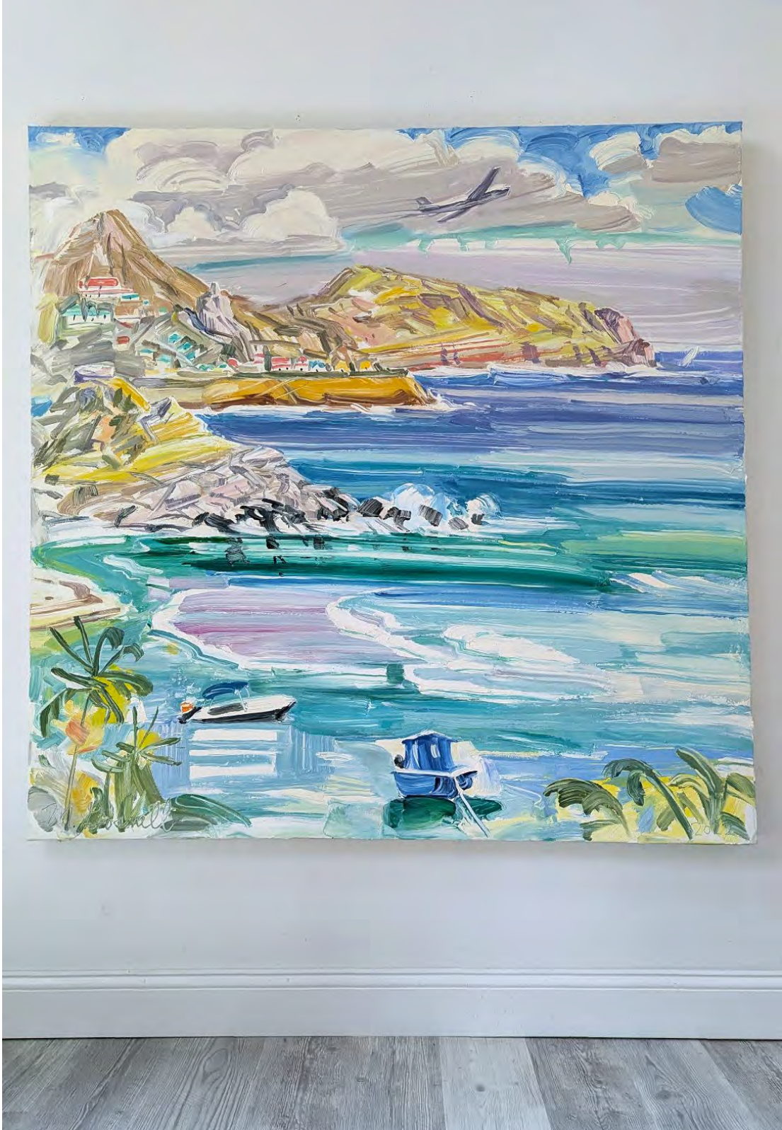
1. Lorient 2 , 60 x 60 in., oil on canvas, 2022 installation view