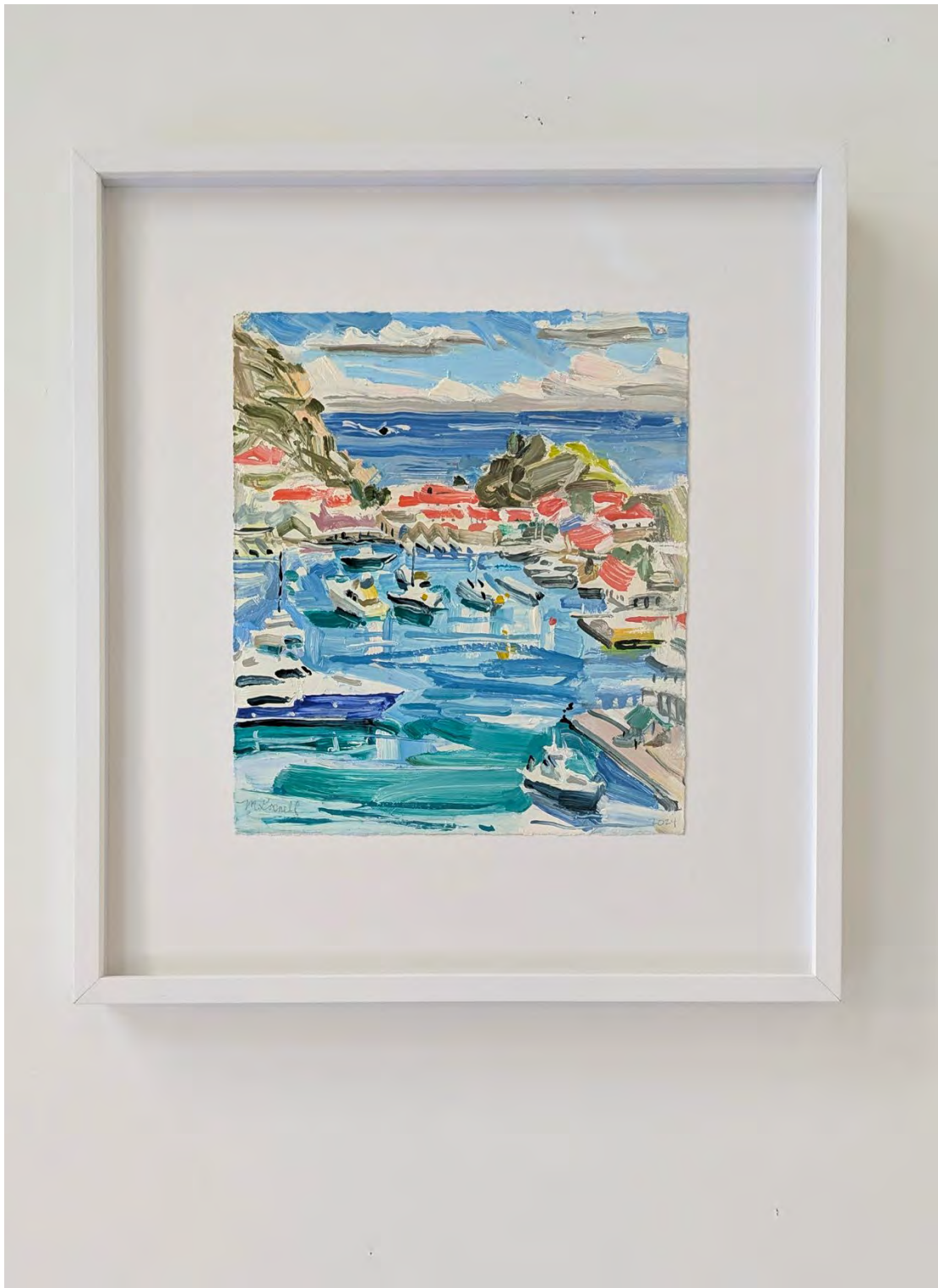
7. Gustavia Port , oil on paper, 12.5 x 11 in., 2024 installation view