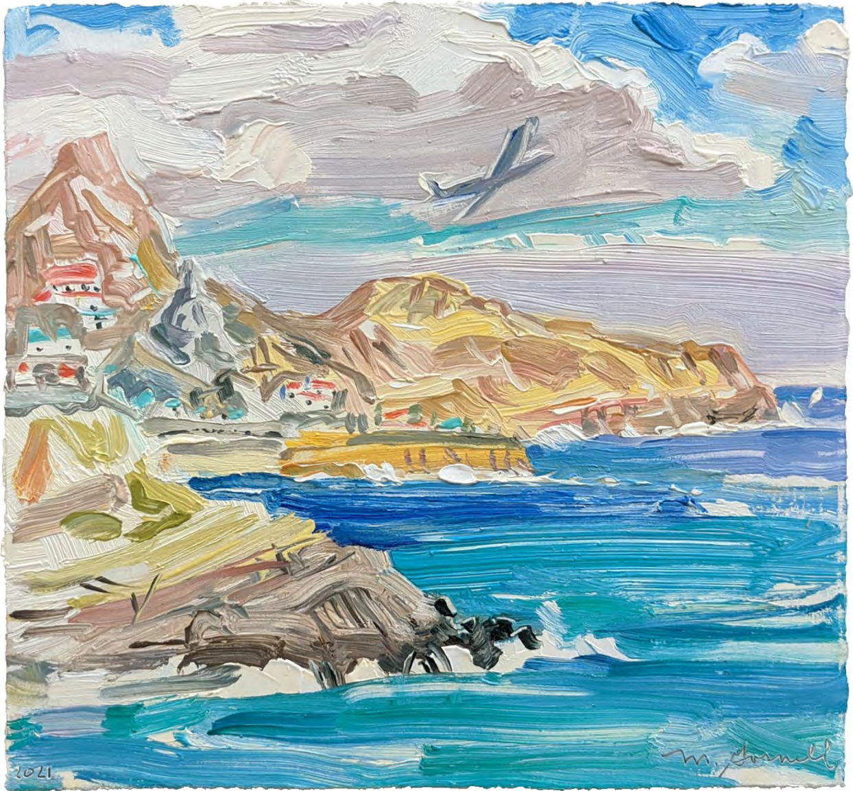
10. Lorient 2 , 10 x 11 in., oil on paper, 2021