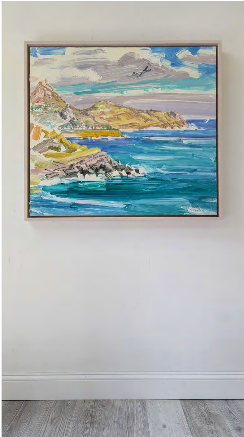
4. Lorient 2 , 36 x 40 in., oil on canvas, 2022 installation view