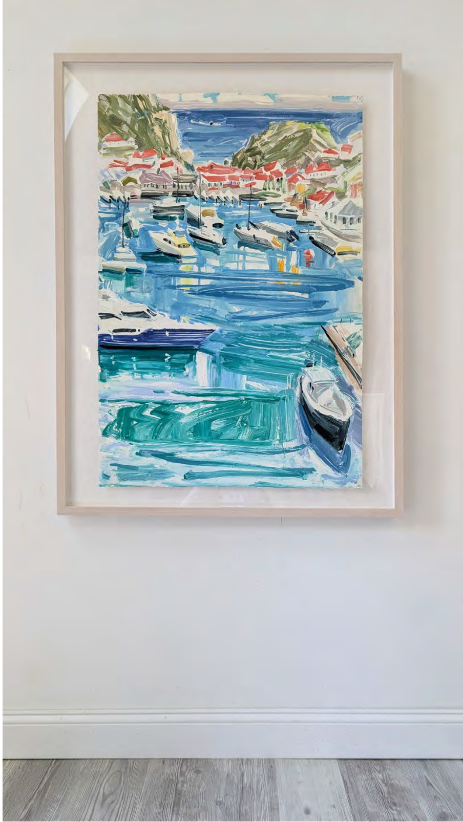
5. Gustavia Port , oil on paper, 41 x 30 in., 2024 installation view