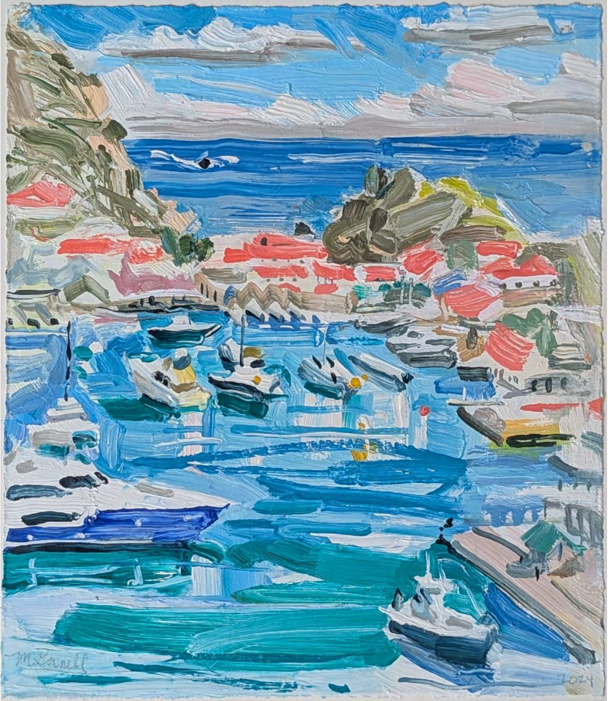
Gustavia Port , oil on paper 12.5 x 11 in., 2024