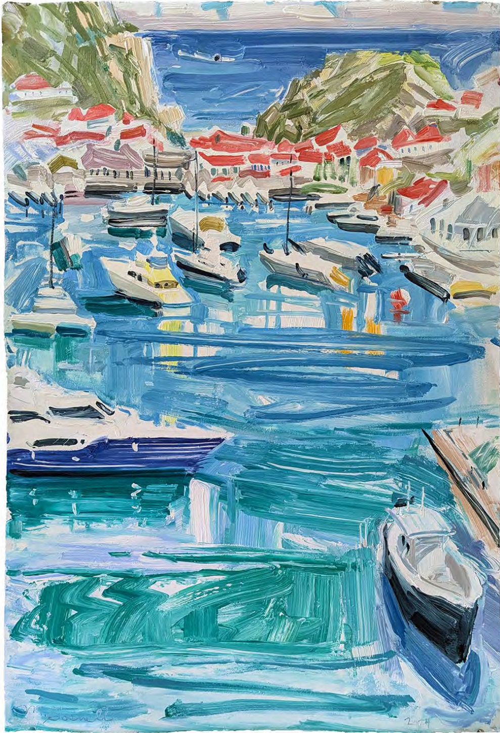
Gustavia Port , oil on paper, 41 x 30 in., 2024