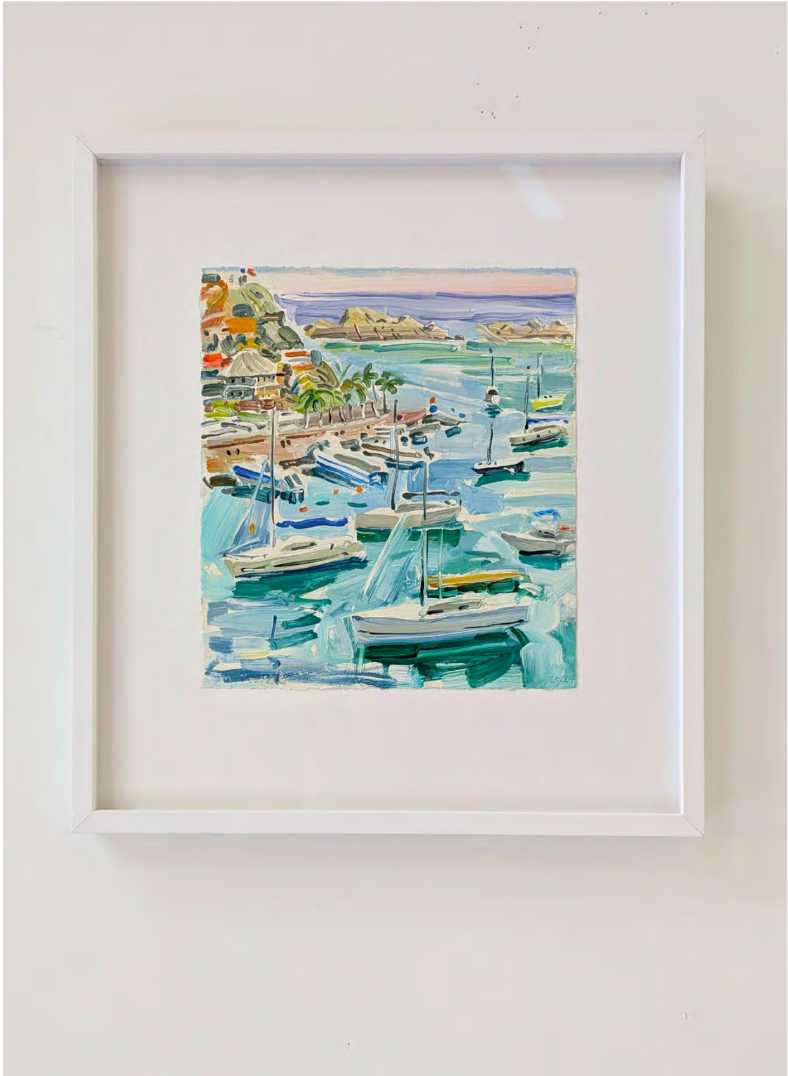
8. Fort Karl, Gustavia , oil on paper, 12.5 x 11 in., 2024 installation view