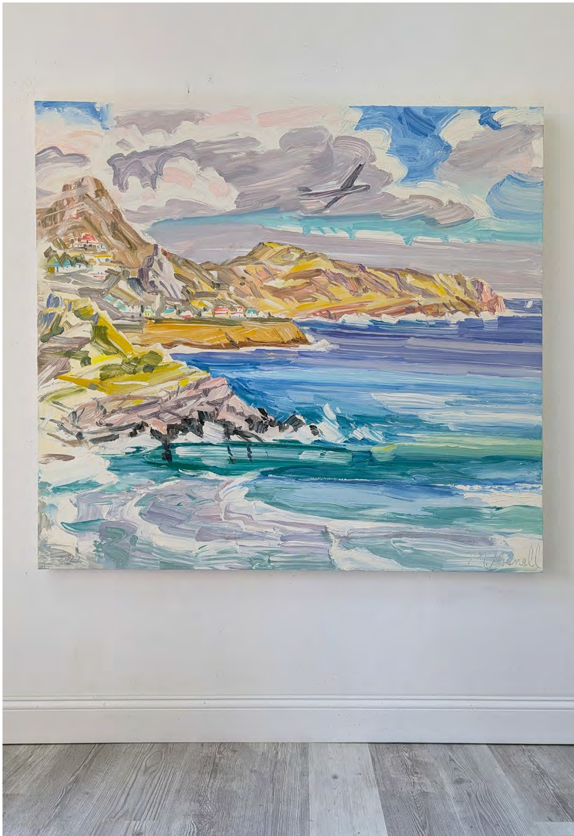
2. Lorient 2 , 54 x 60 in., oil on canvas, 2022 installation view