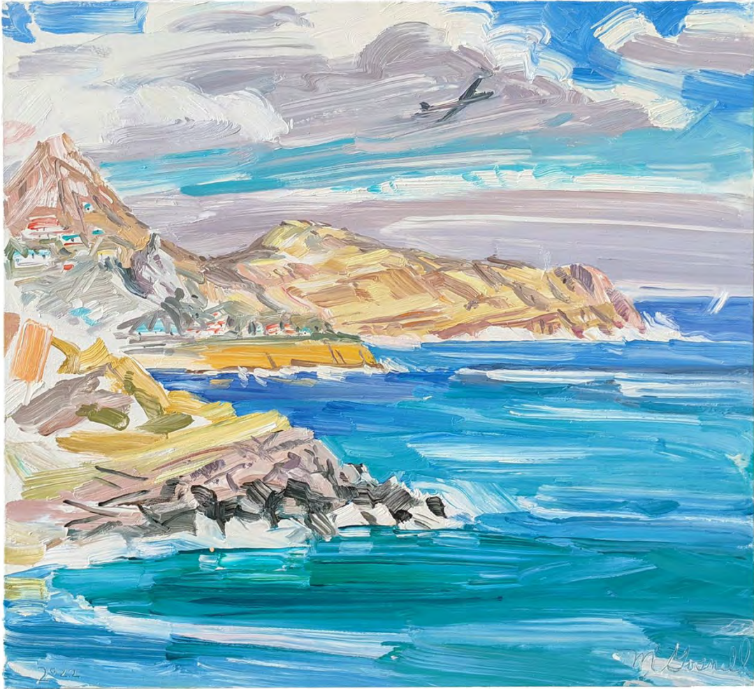
Lorient 2 , 36 x 40 in., oil on canvas, 2022