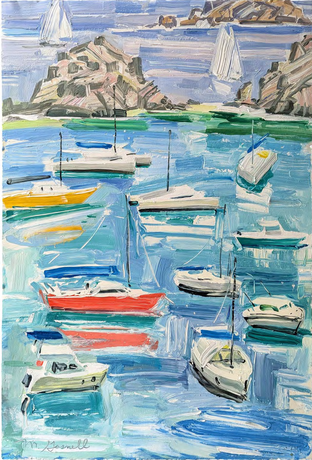
Gustavia Harbor , oil on paper, 41 x 30 in., 2024