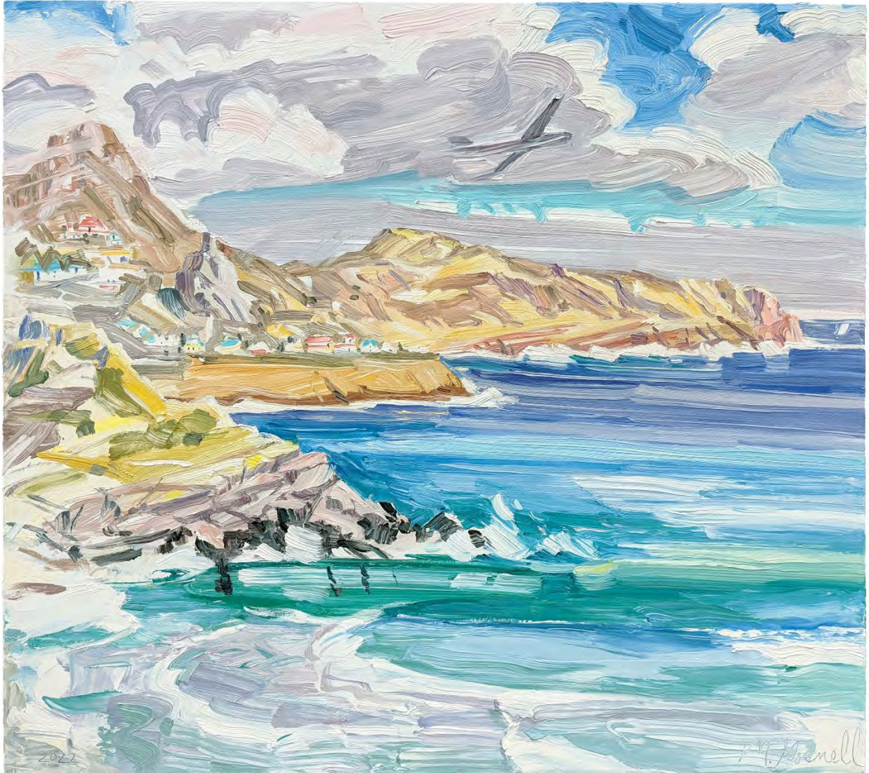
Lorient 2 , 54 x 60 in., oil on canvas, 2022